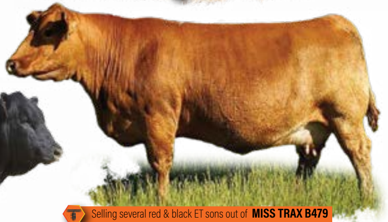
Selling several red & black ET sons out of MISS TRAX B479