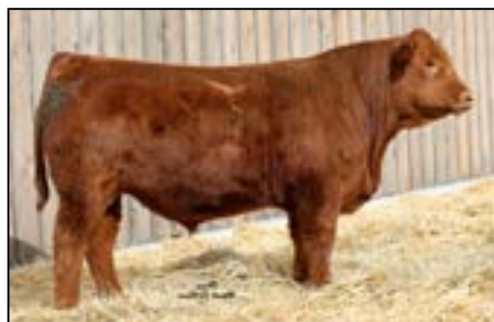
Red Rock Bridle Bit