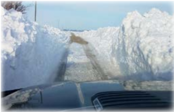
Thankfully, the winter of 2023 is a distant memory!

Homo-Polled Hetero Black. We used Lover Boy on a flush of the B479 cow and had some semen left so used it on other cows. The results were above our expectation. The calves have a nice muscle pattern and being Lover Boy is Hetero-Black, we have a mix of red and black calves out of him. L26 is a twin to L27.