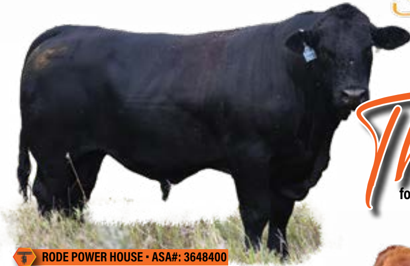
RODE POWER HOUSE • ASA#: 3648400

Thank You for your continued support and business!