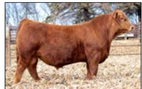
Rockin H Captivate