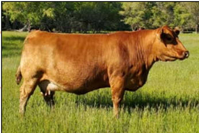
Miss Traxs B479 • Dam of Lot L43

Homo-Polled Nondilutor. ET littermate to the L35 bull who is black. We used Lover Boy because he was hetro-black to get some reds, but yet blacks. This guy will have some friends, big stout and very attractive. The two ET brothers L35, L43 have caught our eye all summer and still do. Well number bulls.