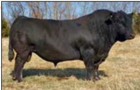
Colorado Bridle Bit