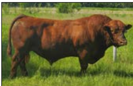
TRAX Red River