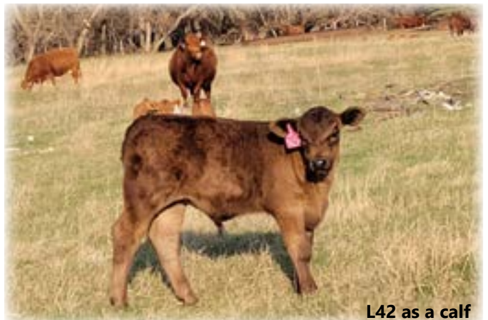
L42 as a calf

Homo-Polled Hetro-Black. Another ET son of the B479 cow that's hetro black. The Pendelton cow just keeps producing good offspring regardless of the mating. That's why this cow is an ET donor. We don't flush many females but the ones we do have to have a great track record, and the B479 cow does. She's the dam to Trax's River and Trax's Bulldog, both performance bulls.