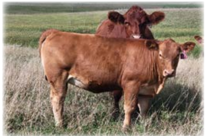
Rockin H Captivate ET heifer

Homo-Polled Hetero-Black. We purposely used a hetero-black bull on this flush of our B479 red female. We felt her genetics are too powerful not to create some unique black offspring. L35 has been a stud all summer long out in the pasture and little has changed since weaning. We like what this guy has to offer to you, stout attractive and complete.