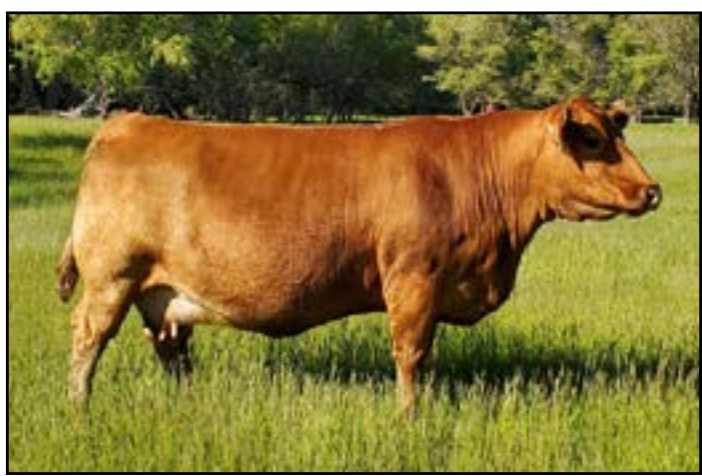
Miss Trax B479 • Dam of Lot L18

Homo-Polled Nondilutor. K19 a moderated framed Red River son that is packed with muscle. He 's the bull that's always walking the fence line when the cows come to drink. K19 has a WW ratio of 103 at 727 lbs.