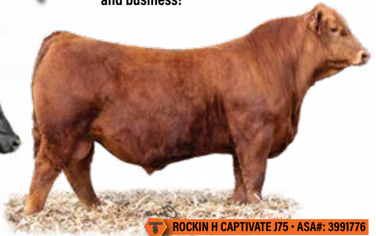
ROCKIN H CAPTIVATE J75 • ASA#: 3991776

Thank You for your continued support and business!