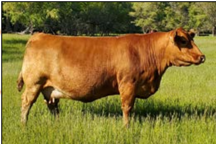
Miss Traxs B479 • Dam of Lots L41 and L42

Homo-Polled Nondilotor. Another ET calf out of the great B479 cow. A red Lover Boy son with power to burn. He had an actual WW of 820 adjusted to 828 lbs. The B479 cow has ratios of BW 99 WW 102 YW 113 on her own calves, pretty easy to see why she became a donor. We have 5 ET calves out of her and all pretty salty, take your pick red or black.