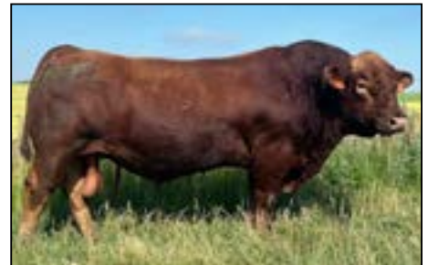
TRAX Bull Dog