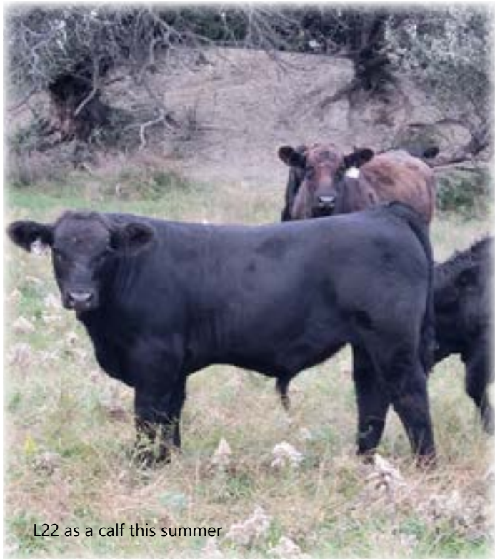
L22 as a calf this summer

Homo-Polled Nondilutor. A Red Rock son out of a first calf heifer that got it done. The Red Rock bull is a true heifer bull, but he still has the ability to produce some growth. L24 carries the muscle pattern we like, thick deep and moves freely. His dam J169, ratioed 105 for WW on this guy.