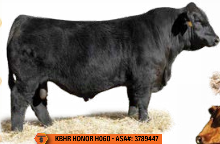
KBHR HONOR H060 • ASA#: 3789447