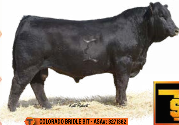
COLORADO BRIDLE BIT • ASA#: 3271382